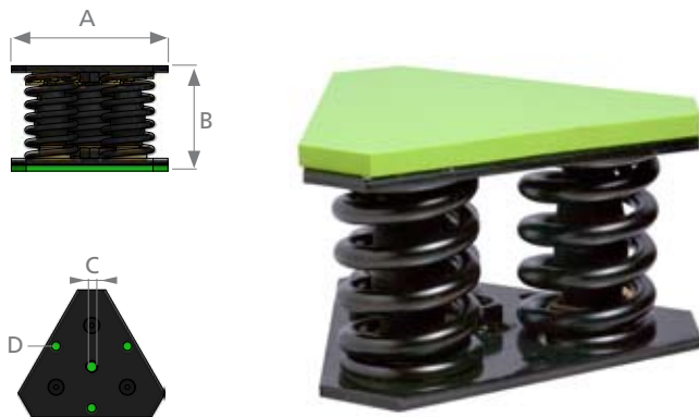
AMC FREQUENZE PROPRIE MECANOCAUCHO® Tipo 3 AMC